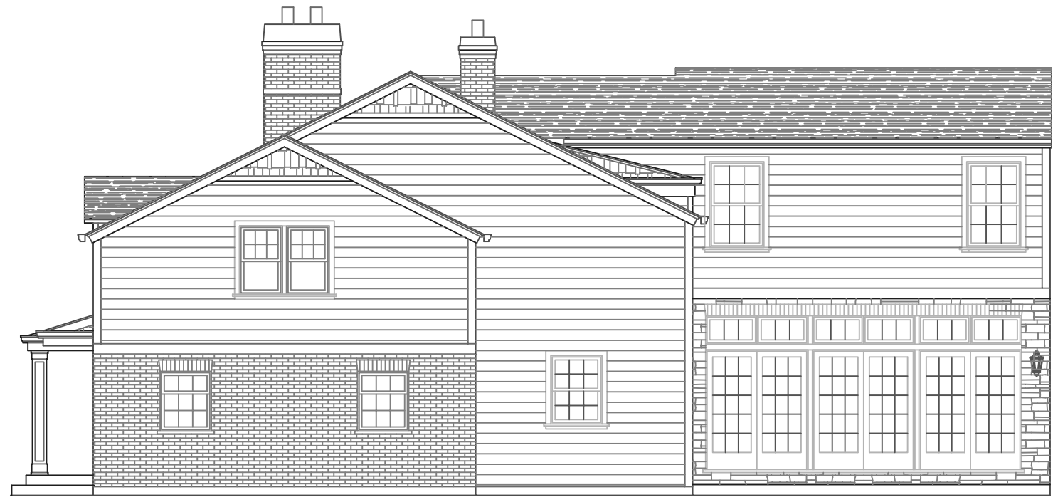
02 PROPOSED NORTH ELEVATION (RIGHT SIDE) SCALE: 1/8"=1'-0"