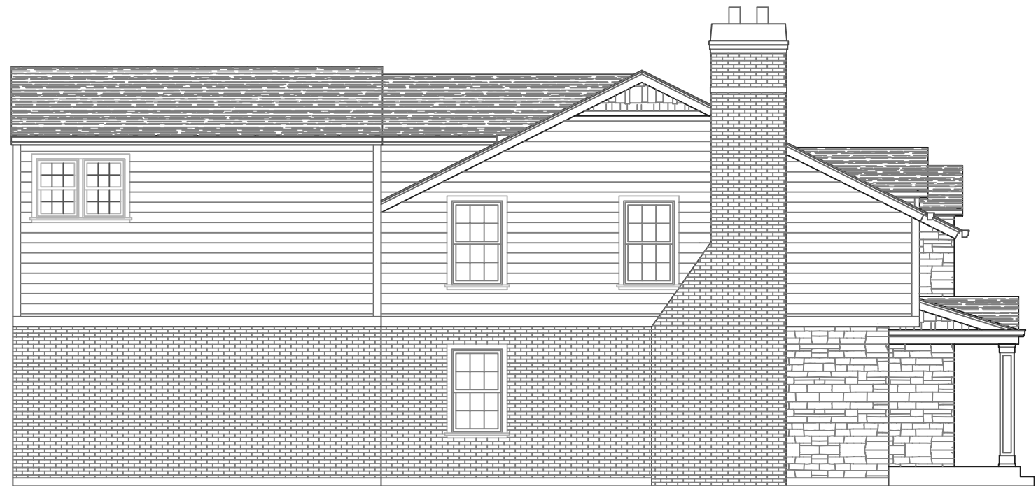
04 PROPOSED SOUTH ELEVATION (LEFT SIDE) SCALE: 1/8"=1'-0"