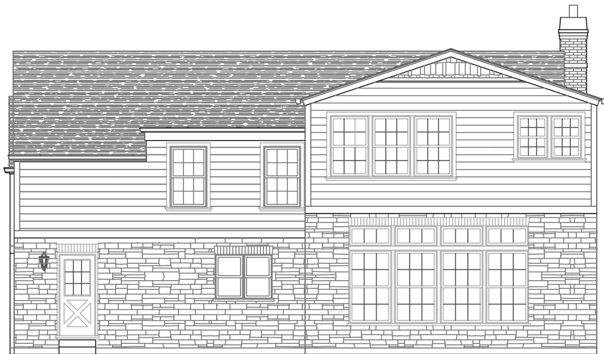
03 PROPOSED WEST ELEVATION (REAR) SCALE: 1/8"=1'-0"