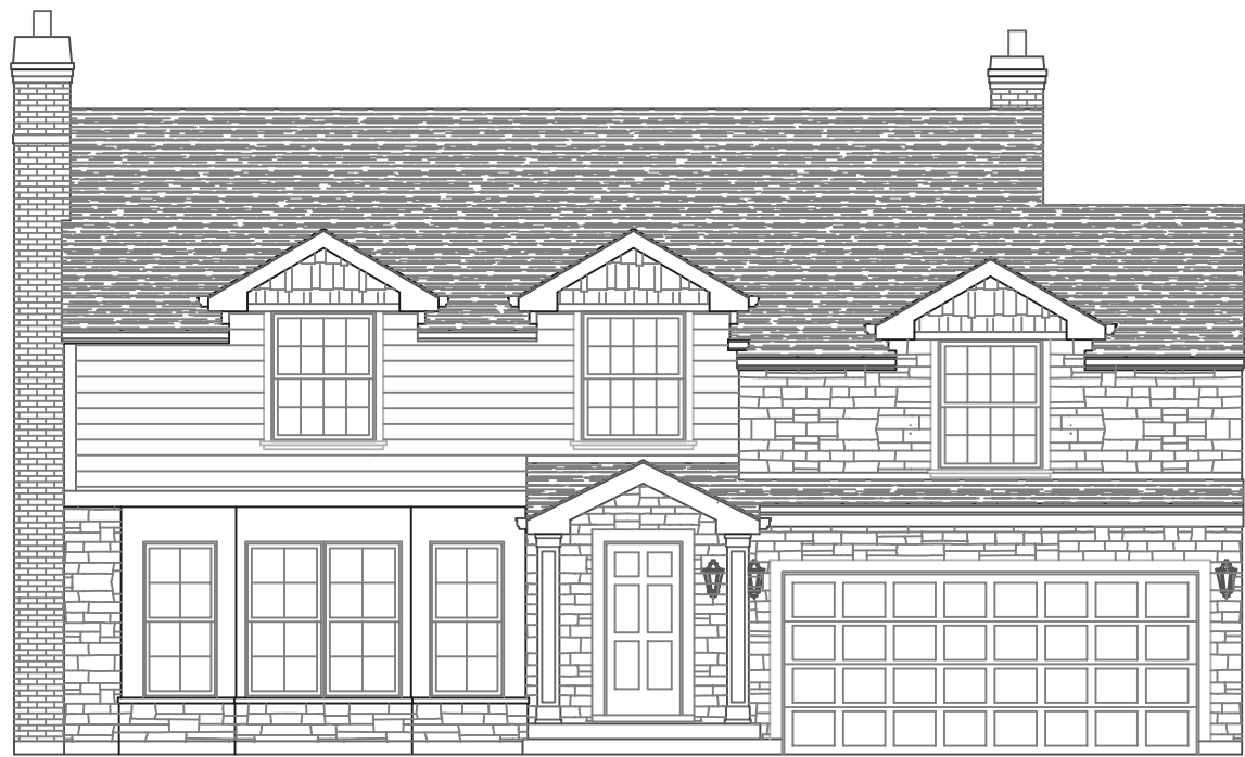
01 PROPOSED EAST ELEVATION (FRONT) SCALE: 1/8"=1'-0"