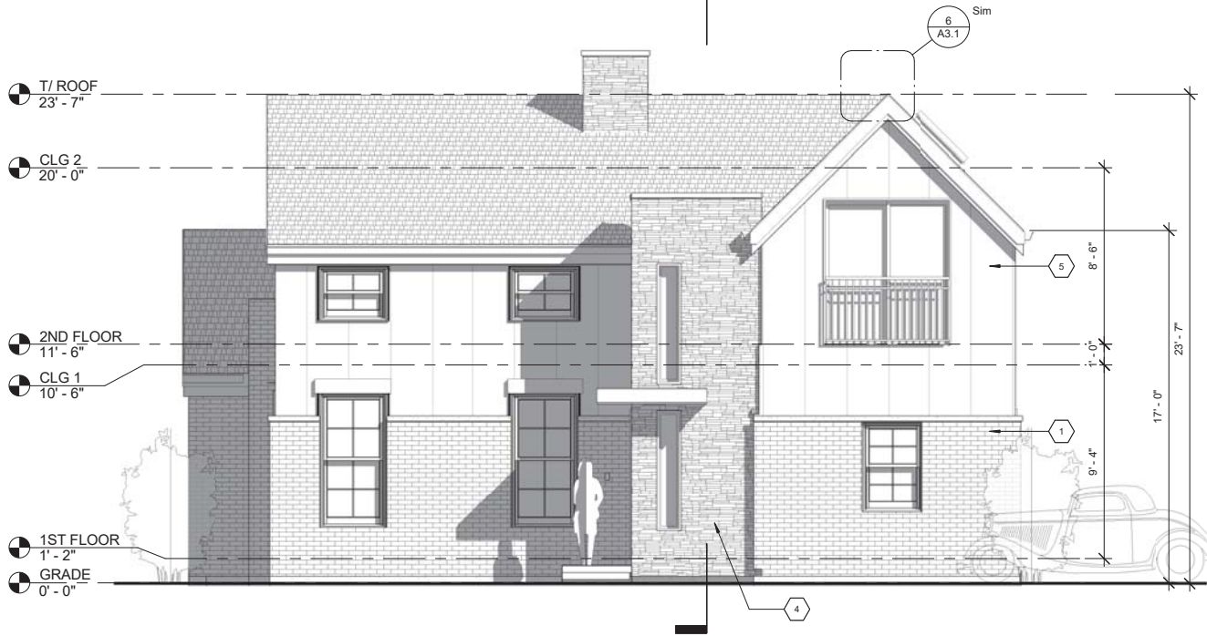
1 PROPOSED WEST ELEVATION (FRONT) r 1/4" = 1'-0"